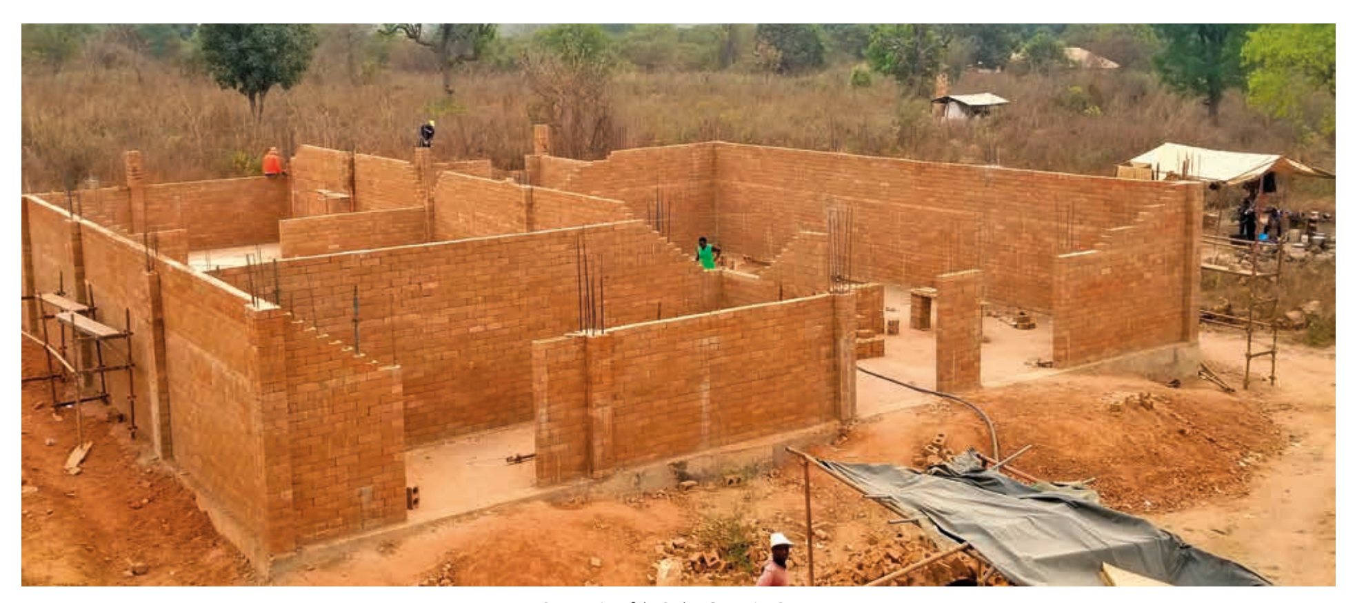
Construction of the Cashew Processing Center.

The project will train 2,270 farmers and 40 young students from the Vocational School of Bissorã in techniques to improve production, management and processing of the cashew apple, as well as handling the electrical and photovoltaic equipment involved in these processes. It also includes awareness actions related to nutrition, hygiene, community health, conflict resolution and gender equality.