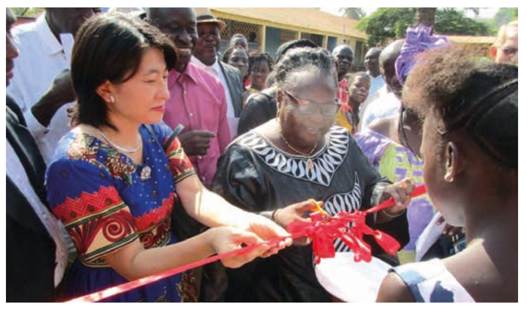
Inauguration of the new classrooms.

The identified shortcomings had been negatively affecting teaching and learning at the school. Of the existing classrooms, 14 were made from quirintim (woven bamboo or reeds), a traditional material in Guinea-Bissau. Following this diagnosis, ADPP Guiné-Bissau developed the project Rebuilding the Path of Education in Guinea-Bissau , which aimed to construct seven new classrooms, each properly equipped with tables, chairs and lockers for teachers and students.