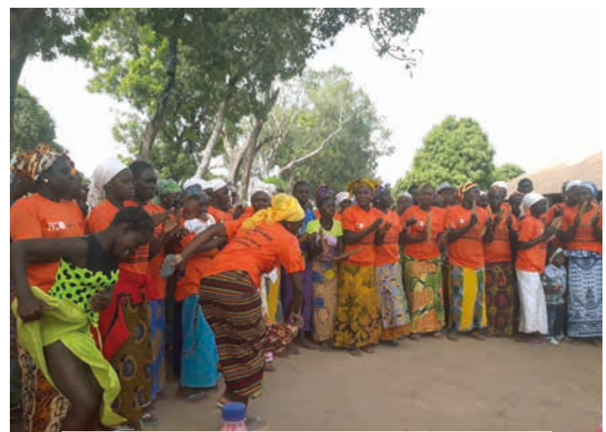
Public Declaration of the Abandonment of the Female Genital Mutilation.