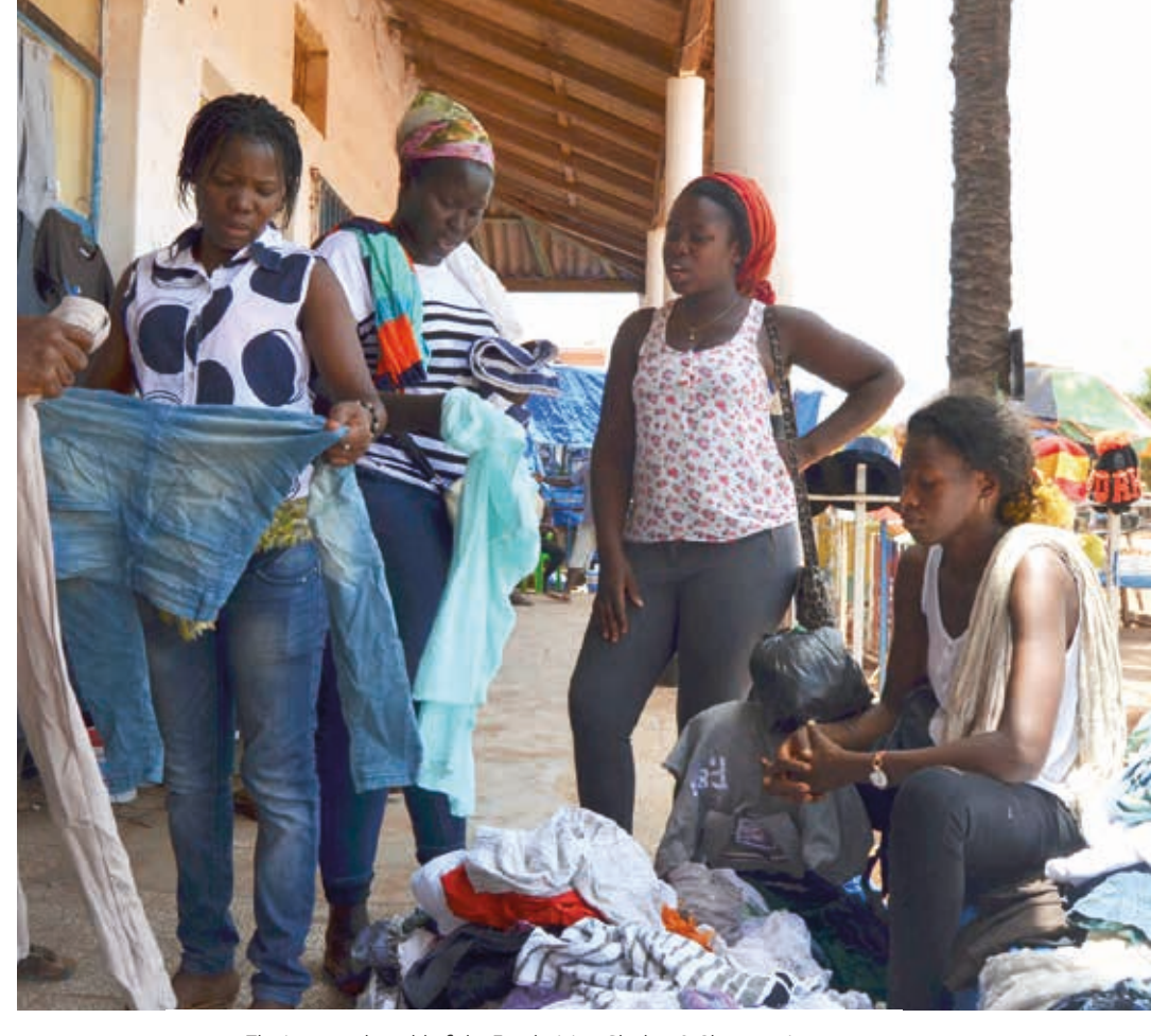
The items to be sold of the Fundraising Clothes & Shoes project.