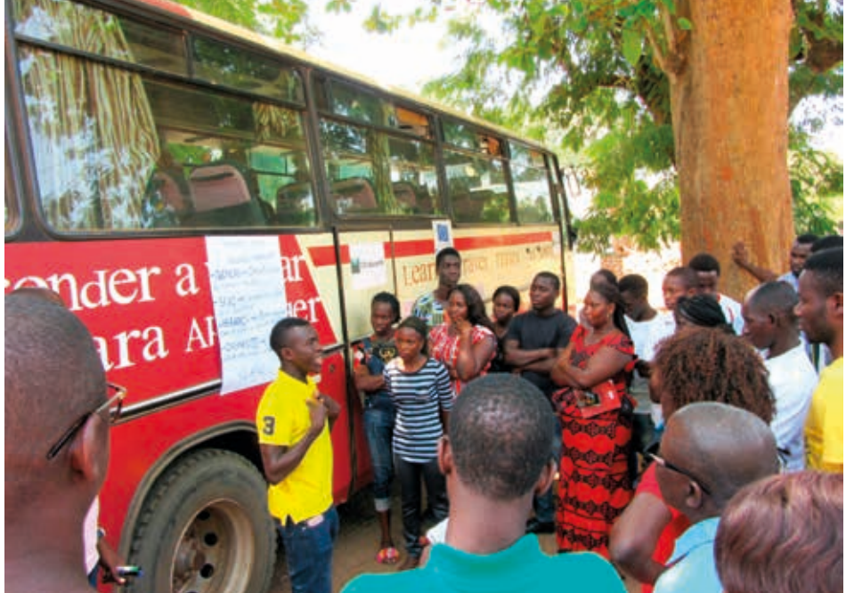
Training on Human Rights for the students of the Teacher Training College in Bachil.