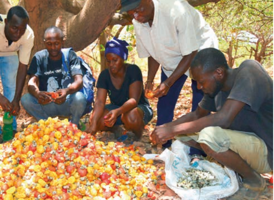
ADPP Guiné-Bissau's cashew plantations.