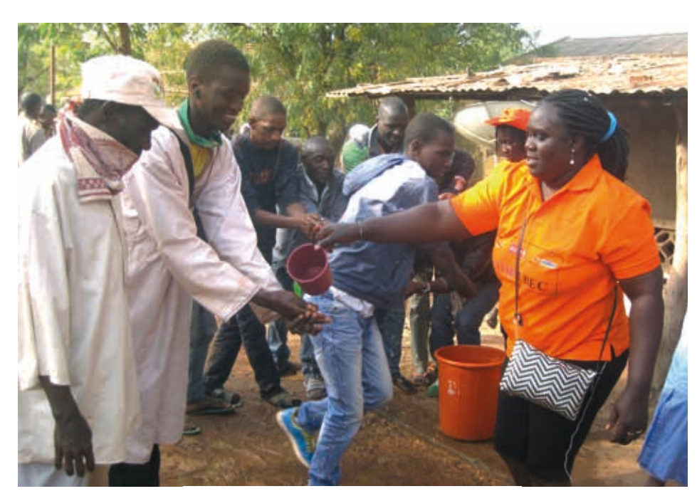
Actions on hygiene and sanitation in 309 communities.