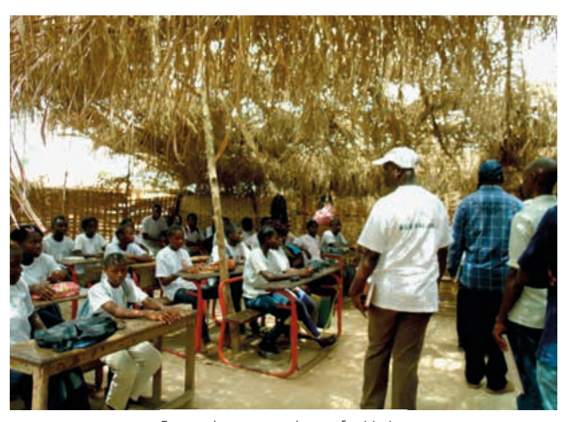
Former classroom made out of quirintim.

n 2017, ADPP Guiné-Bissau and the Embassy of Japan in Senegal made a significant contribution to infrastructural and material improvements at the Cassacá Congress School. It is one of the largest primary schools in Bissau, serving 1,040 students per day with 42 teachers.