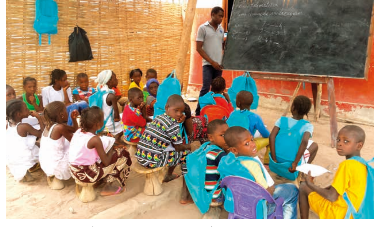
The student of the Teacher Training College during 6 month full-time teaching practice.

In 2017, the school year's theoretical and practical components were implemented with enthusiasm by students and teachers, making a great contribution to their professional preparation. New developments include the training in Human Rights Education , through a project financed by the Embassy of the Kingdom of the Netherlands , in order to increase the skills of the future teachers to teach and act on the issues concerning fundamental human rights.