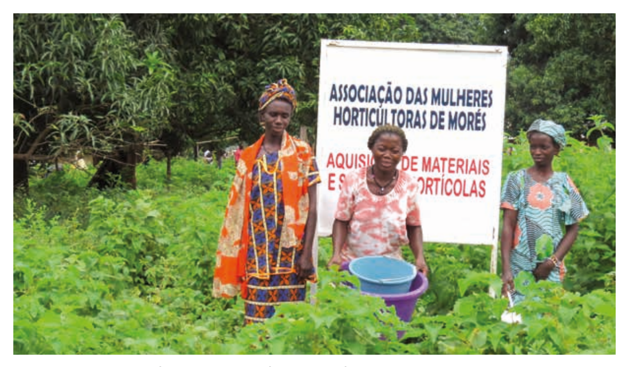
The Association of Women Horticulturists of Morés was one of 24 associations supported by the Custom Fund.

It is a conditional tax in the sense that some part of the taxes that ADPP Guiné-Bissau recovers are channeled to various projects of ADPP Guiné-Bissau and local associations in the Oio region. In 2017, the associations benefited by the fund carried out activities related to public health; agriculture, including the installation of a seed multiplication field; the acquisition of fencing; the acquisition of seeds; rice production; the purchase and sale of fish; HIV/AIDS awareness; the maintenance of a youth club and the completion of the headquarters of the Nhacra Youth Association for Action and Development.